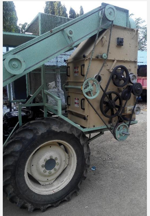
On-board-Pre-cleaner for Mechanically Harvested Cotton mounted on tractor

A 600 mm wide onboard cleaner based on sling off action is designed and developed for on-field cleaning of cotton harvested using cotton stripper. It consists of a 440 mm kicker cylinder for breaking of cotton pods and bracts. Seed cotton along with broken cotton pods and bracts enters the cleaning stage of machine that consists of a saw channel cylinder of 286 mm diameter. Therefrom the cleaned cotton is doffed using a doffing assembly while the uncleaned cotton is further cleaned in a reclaimer having 222 mm diameter channel saw cylinder. The cleaned cotton is blown towards a cotton storage basket attached at the end of the stripper harvester. The onboard cleaner is being optimised for cleaning of the machine stripped cotton.