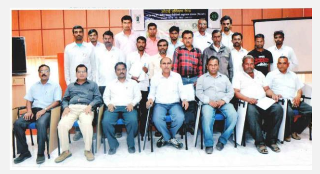
Group photo of farmers training at GTC Nagpur

Ginning Training Centre (GTC), Nagpur conducted a training programme for farmers on "Post-harvest technology and value addition to cotton by-produce" during 8-12<sup>th</sup> February, 2016. Seventeen farmers, participated in the training. The training module dealt with logistics and supply of cotton stalks to industries and in-situ utilization of cotton stalks by compositing for additional remuneration and soil fertility management.