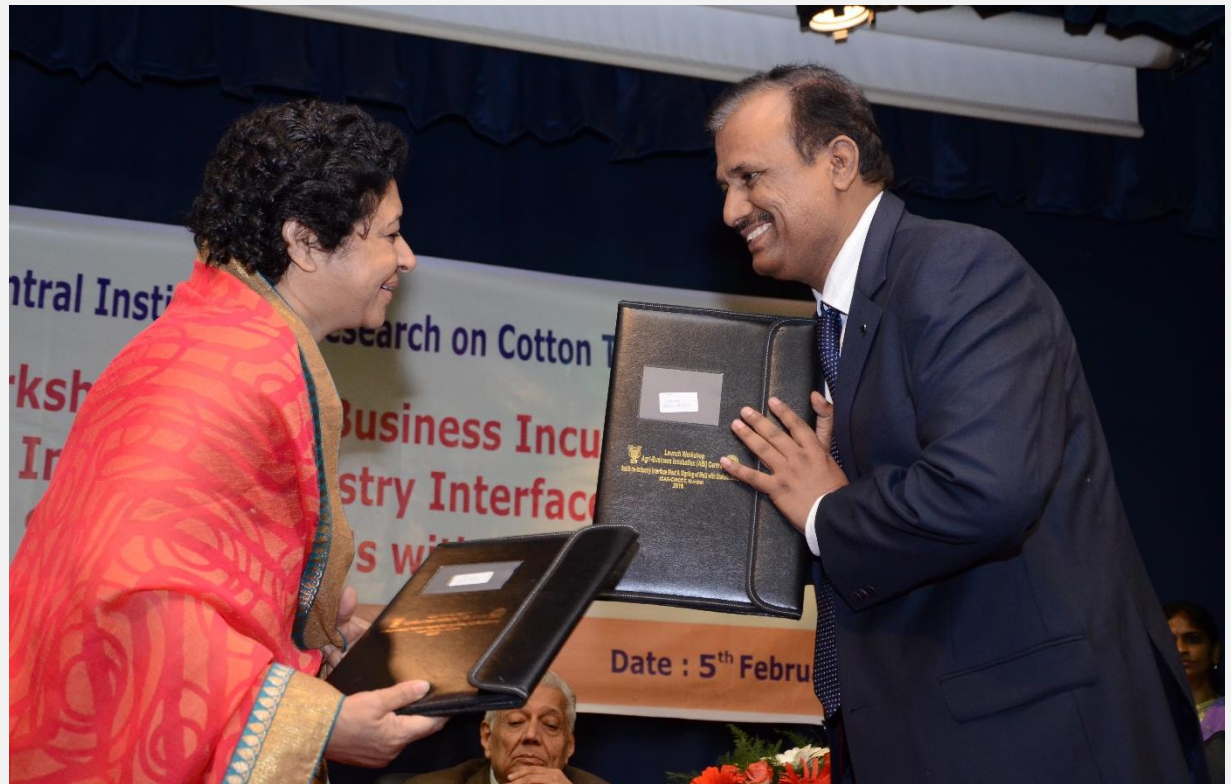
MoU signed with M/s. Green Globe, Mumbai on "Consultancy in Textile materials for antibacterial treatment" on 5<sup>th</sup> February, 2016

MoU signed with M/s Precision Tooling Engineers, Nagpur on "Research & Development of Lint Opener for preparation of samples for cotton quality evaluation "on 5<sup>th</sup> February, 2016