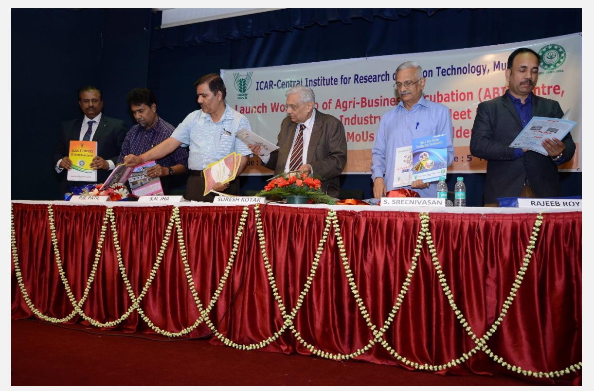
Release of publications viz., ICAR-CIRCOT Hindi E-newsletter, ICAR-CIRCOT English Enewsletter, pamphlet on Nano Zinc Oxide Production Technology and brochure on "A Glimpse of ICAR-CIRCOT"