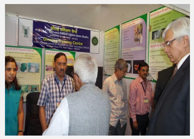
CIRCOT staff interacting with visitors on the event "Youth Empowerment Summit"

IIEFA (Industries, Innovators, Entrepreneurs, Facilitators and Academia) 2016