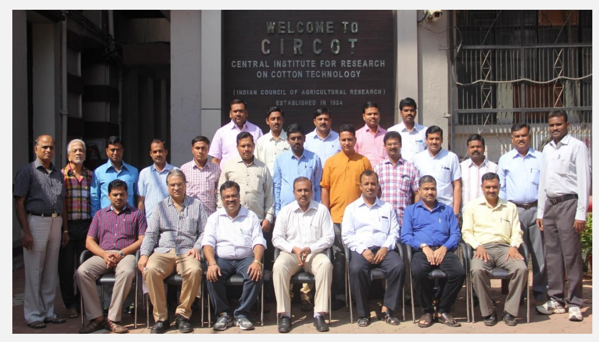
Group photo: Training on Quality Evaluation of Cotton Batch: 8-12th February, 2016)

Director, ICAR-CIRCOT followed by introductory lectures on cotton post harvest technology including cotton quality evaluation. During the training period participants were made acquainted with instrumental testing of cotton as well as visual grading through series of lectures and demonstrations at various in house labs.