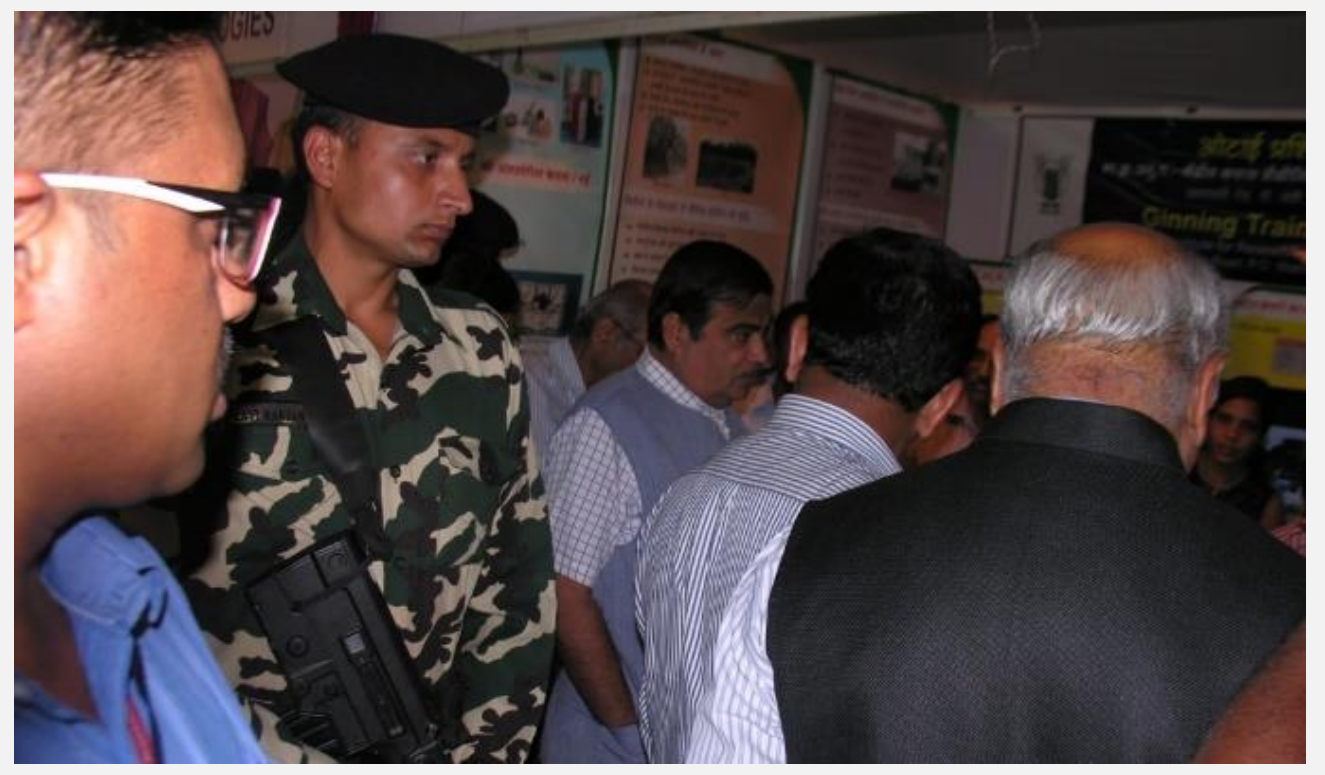
Shri. Nitin Gadkari, Hon'ble Union Minister, Ministry of Road Transport and Highways & Shipping, Govt of India at ICAR-CIRCOT stall

Nagpur during 5-7<sup>th</sup> February, 2016. The theme of the program was inducting indigenous technology for country's growth with focus on MSME's. The program was inaugurated by Dr. Anil Kakodkar, Former Chairman, Atomic Energy Commission of India. GTC of ICAR-CIRCOT participated in the meet and displayed various technologies developed by the institute. Shri. Nitin Gadkari Ji, Hon'ble Union Minister, Ministry of Road Transport and Highways & Shipping, Govt of India visited CIRCOT stall on the valedictory day.