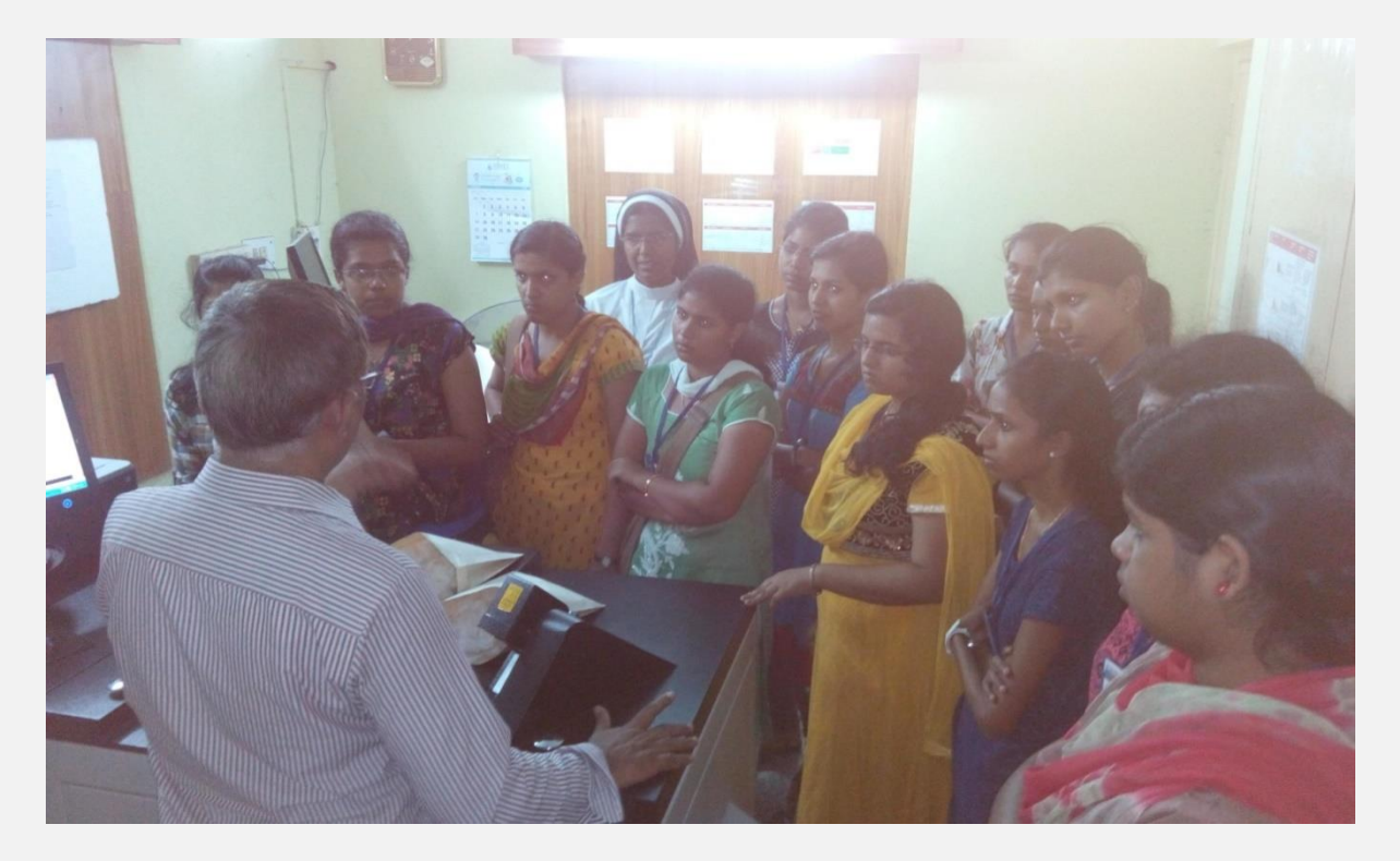
Students from B.K. College for Women, Kottayam, Kerala visited Quality Evaluation Unit, ICAR-CIRCOT, Coimbatore on 20th February, 2016 (25 Students)