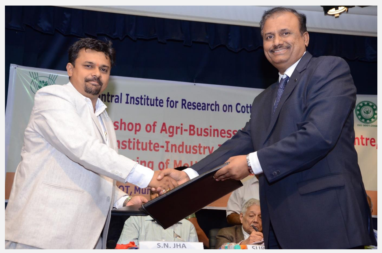
MoU signed with Lafarge India Private Limited, Mumbai on "Application of nanocellulose in cement, mortar, plaster and concrete synthesis for enhancement of functional, physical and mechanical properties" on 5<sup>th</sup> February, 2016

MoU signed with Veermata Jijabai Technological Institute, Mumbai on "Application of nanocellulose in cement, mortar, plaster and concrete synthesis for enhancement of