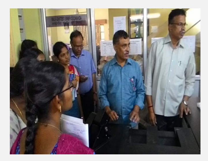
Ph.D Students from Centre for Plant Breeding and Genetics, TNAU , Coimbatore visited Quality Evaluation unit, ICAR-CIRCOT Coimbatore on 8<sup>th</sup> Feb, 2016 (20 students)